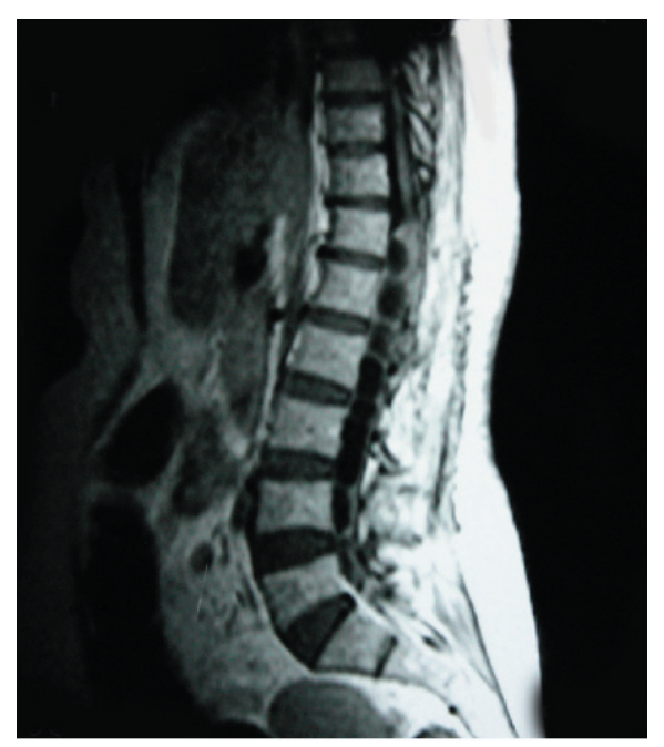
Figure 1. Sagittal T1 weighted MR image shows multiple-multiseptate, hypointense cystic lesion.

walls (5,6). The fluid content of HC is isointense with CSF on T1 and T2 WI, but the cyst wall is seen as rim shaped which has low signal intensity on T1 WI and T2 WI on MRI. After iv contrast injection, the rim generally