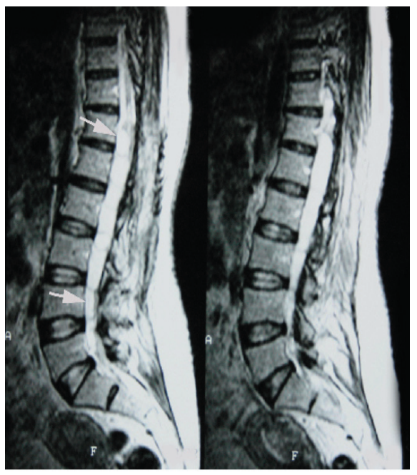
Figure 2. T2- weighted image shows hyperintense, intradural-extramedullary cystic lesion at Th 12- L5 level (white arrows).

does not enhance, and calcification of the wall of the cyst is rare (3). Enhanced ringshaped wall can be seen if the cyst is infected (1). In our case, no contrast enhancement or calcification was present.